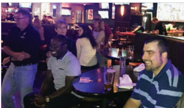
Participants in the Cadaver Open Bowling Tournament