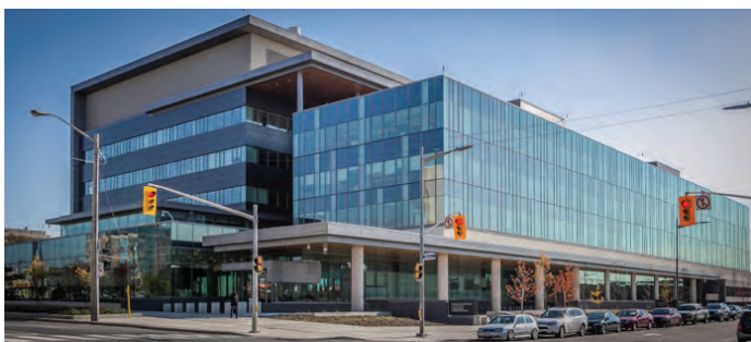
Forensic Services and Coroners Complex (FSCC) Toronto

Ontario has a hub and spoke arrangement to deliver forensic pathology services. The headquarters of the Ontario Forensic Pathology Service is in a 50,000 square metre state-of-the-art building, the Forensic Services and Coroners Complex (FSCC) in Toronto, which also houses the Office of the Chief Coroner for Ontario, the Centre for Forensic Sciences and the Office of the Fire Marshal and Emergency Management. The OFPS will host the International Association of Forensic Sciences in August 2017 in Toronto. Other centres are in hospitals in regional cities in London, Hamilton, Kingston, Ottawa, Sudbury and Sault St. Marie. These units are linked to medical schools and the Forensic Pathologists hold academic positions in Universities. In Ontario approximately 7000 autopsies are conducted each year, with the majority performed in Toronto or one of the regional centres. As well as forensic pathologists conducting autopsies, there are hospital based anatomical and pediatric pathologists who conduct some medico-legal autopsies, though not on homicides or criminally suspicious deaths.