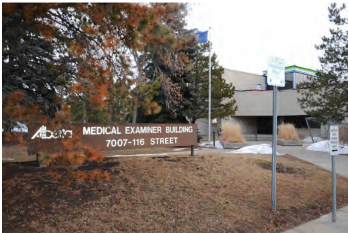
Medical Examiner Office Alberta

population, trials in Nunavut may be in Inuktitut, which can be a challenge to translate medical terms, among others.