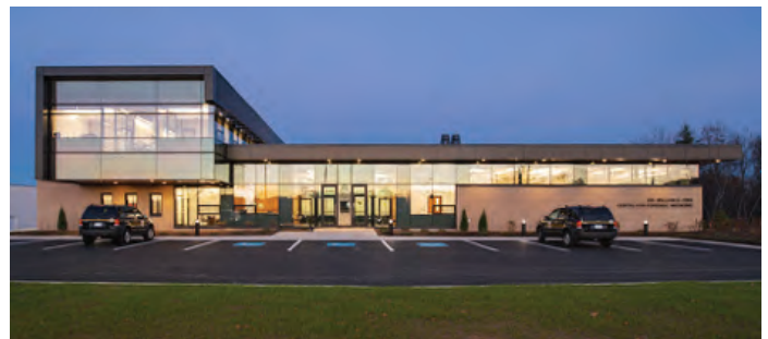
Nova Scotia Medical Examiner Office – Dr. William D Finn Centre