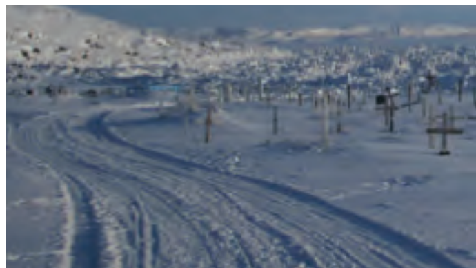
Cemetery in Iqaluit – providing services in remote areas is a challenge