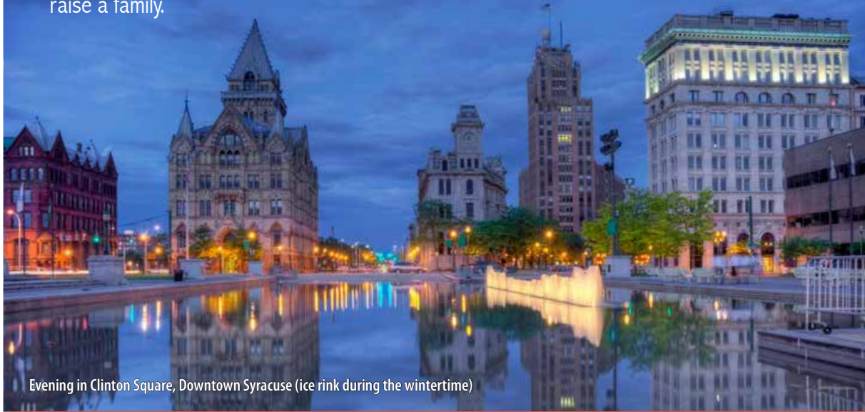
Evening in Clinton Square, Downtown Syracuse (ice rink during the wintertime)

From tech, the arts, cultural events, and beautiful natural surroundings to sports and seasonal outdoor activities, Onondaga County is a great place to live, work, play, and raise a family.