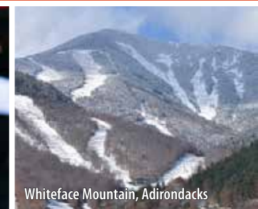
Whiteface Mountain, Adirondacks