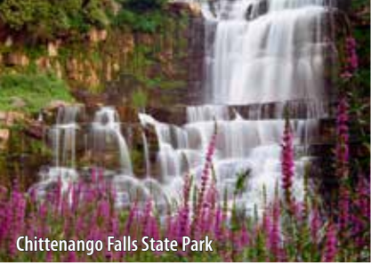
Chittenango Falls State Park