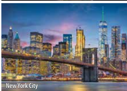
New York City