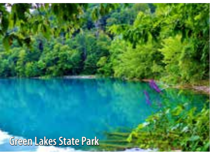
Green Lakes State Park