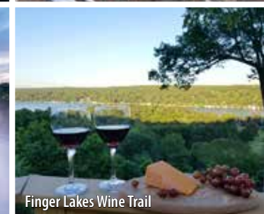
Finger Lakes Wine Trail