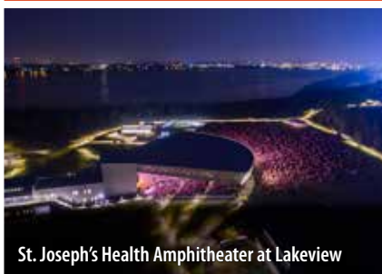
St. Joseph's Health Amphitheater at Lakeview