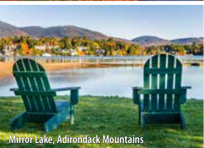
Mirror Lake, Adirondack Mountains