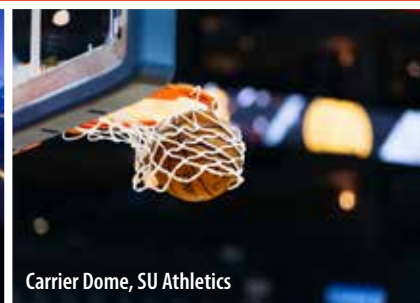
Carrier Dome, SU Athletics