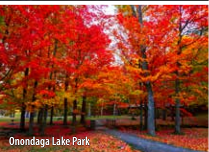
Onondaga Lake Park