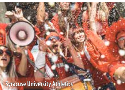
Syracuse University Athletics