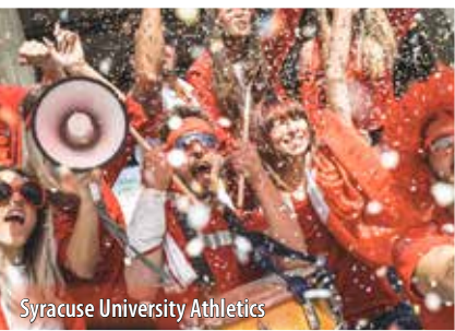
Syracuse University Athletics