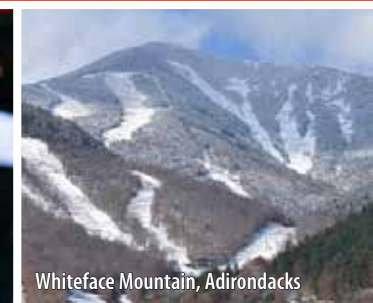
Whiteface Mountain, Adirondacks