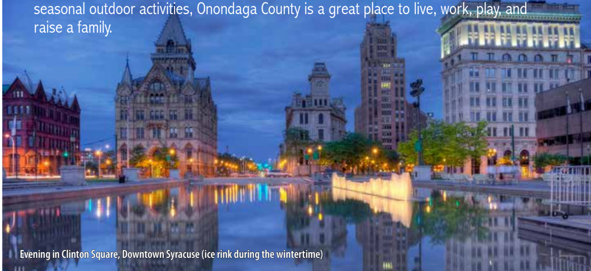
Evening in Clinton Square, Downtown Syracuse (ice rink during the wintertime)

From tech, the arts, cultural events, and beautiful natural surroundings to sports and seasonal outdoor activities, Onondaga County is a great place to live, work, play, and raise a family.