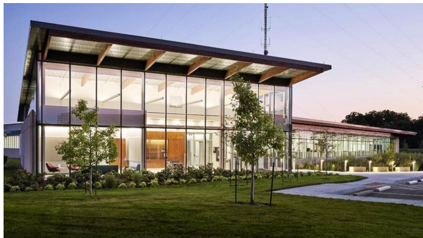
Johnson County Medical Examiner's Office Building

Johnson County, with a population of almost 600,000, is located in northeast Kansas and close to metropolitan Kansas City, Missouri – home to the 2020 Super Bowl champions, the Chiefs and the 2015 World Series winners, the Royals. In 2018, USA Today named Johnson County one of the top twenty best counties in the nation. Johnson County consistently ranks #1 in the "County Health Rankings" and is home to award winning parks (including several dog parks) and libraries. Johnson County has six excellent school districts and several colleges. Museums, performing arts, various professional sports, and the Kansas City International Airport are all nearby.