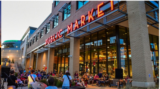
Public Market, Lenexa, KS