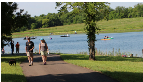
Lexington Lake Park, DeSoto, KS

https://careers-jocogov.icims.com/jobs/2156/deputy-medical-examiner-%28unclassified-exempt%29/job