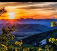
Blue Ridge Mountains