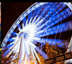
Centennial Olympic Park