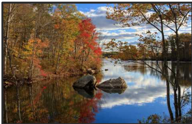
Lincoln Woods, Lincoln