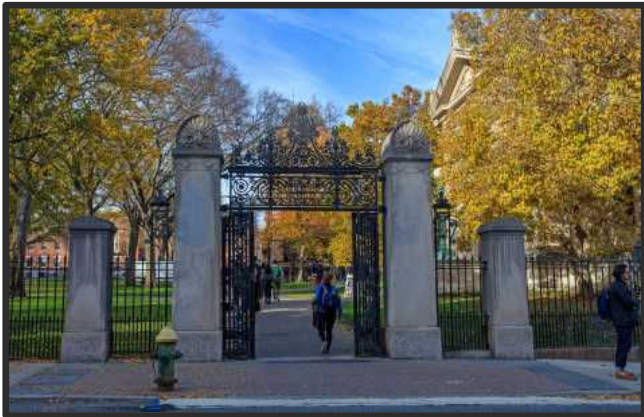
Brown University, Providence