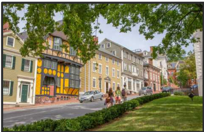
College Hill, Providence