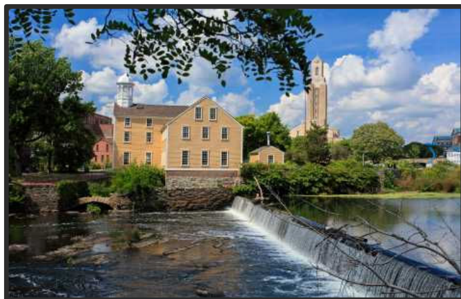
Slater Mill, Pawtucket