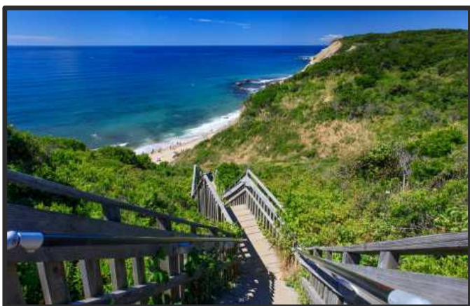
Mohegan Bluffs, Block Island