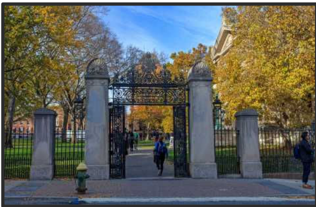
Brown University, Providence