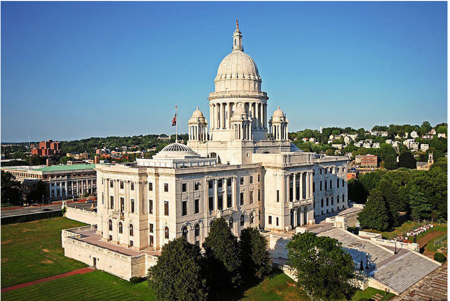
Rhode Island State House