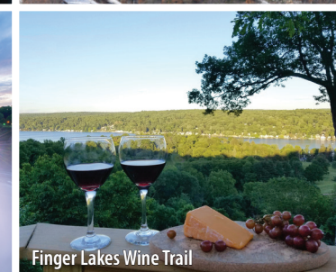
Finger Lakes Wine Trail