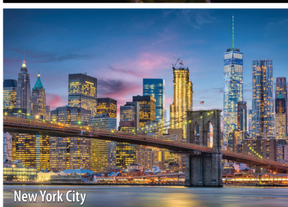
New York City