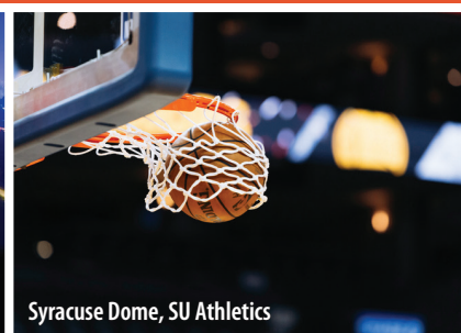
Syracuse Dome, SU Athletics