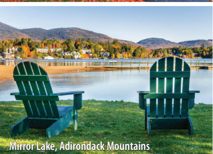
Mirror Lake, Adirondack Mountains