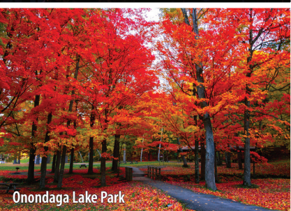
Onondaga Lake Park