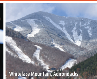
Whiteface Mountain, Adirondacks