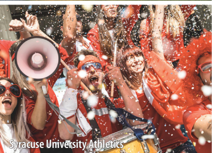
Syracuse University Athletics