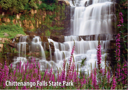
Chittenango Falls State Park