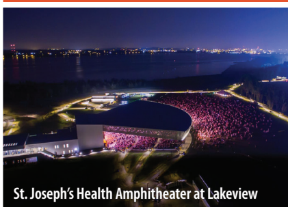
St. Joseph's Health Amphitheater at Lakeview