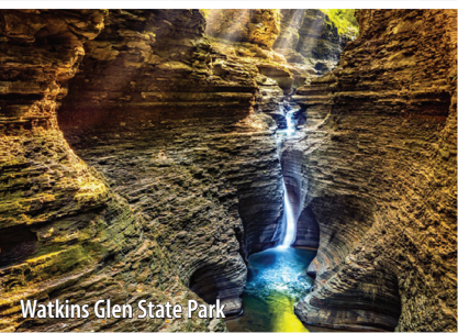
Watkins Glen State Park