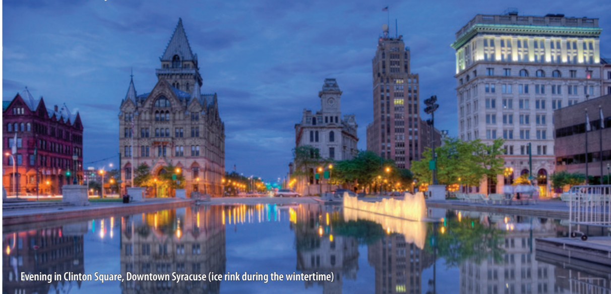
Evening in Clinton Square, Downtown Syracuse (ice rink during the wintertime)

From tech, the arts, cultural events, and beautiful natural surroundings to sports and seasonal outdoor activities, Onondaga County is a great place to live, work, play, and raise a family.