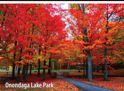
Onondaga Lake Park