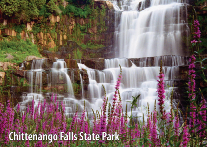
Chittenango Falls State Park