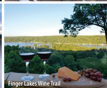
Finger Lakes Wine Trail