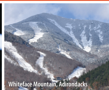
Whiteface Mountain, Adirondacks