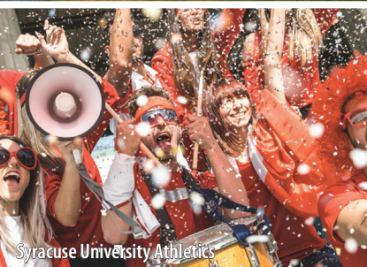
Syracuse University Athletics