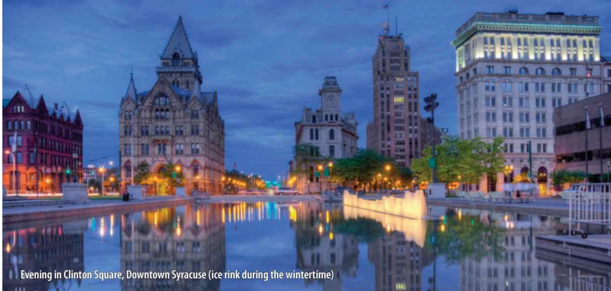
Evening in Clinton Square, Downtown Syracuse (ice rink during the wintertime)

From tech, the arts, cultural events, and beautiful natural surroundings to sports and seasonal outdoor activities, Onondaga County is a great place to live, work, play, and raise a family.