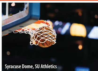
Syracuse Dome, SU Athletics