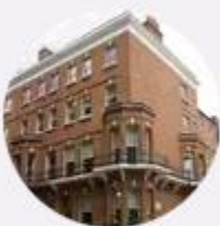
Mark Twain House