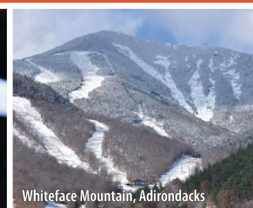
Whiteface Mountain, Adirondacks