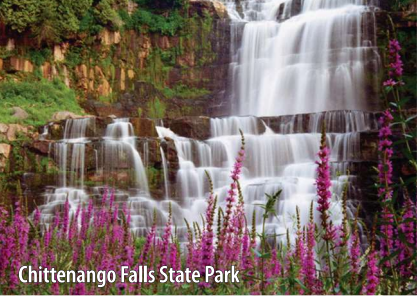
Chittenango Falls State Park