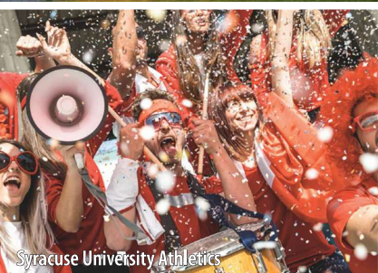
Syracuse University Athletics