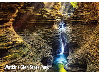
Watkins Glen State Park