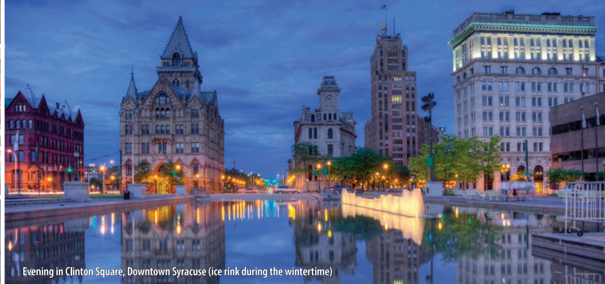
Evening in Clinton Square, Downtown Syracuse (ice rink during the wintertime)

From tech, the arts, cultural events, and beautiful natural surroundings to sports and seasonal outdoor activities, Onondaga County is a great place to live, work, play, and raise a family.