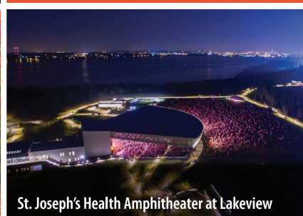
St. Joseph's Health Amphitheater at Lakeview