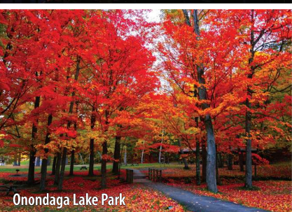
Onondaga Lake Park