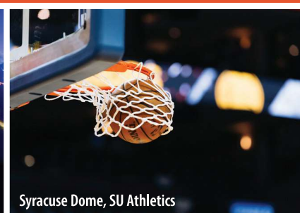
Syracuse Dome, SU Athletics