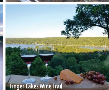
Finger Lakes Wine Trail