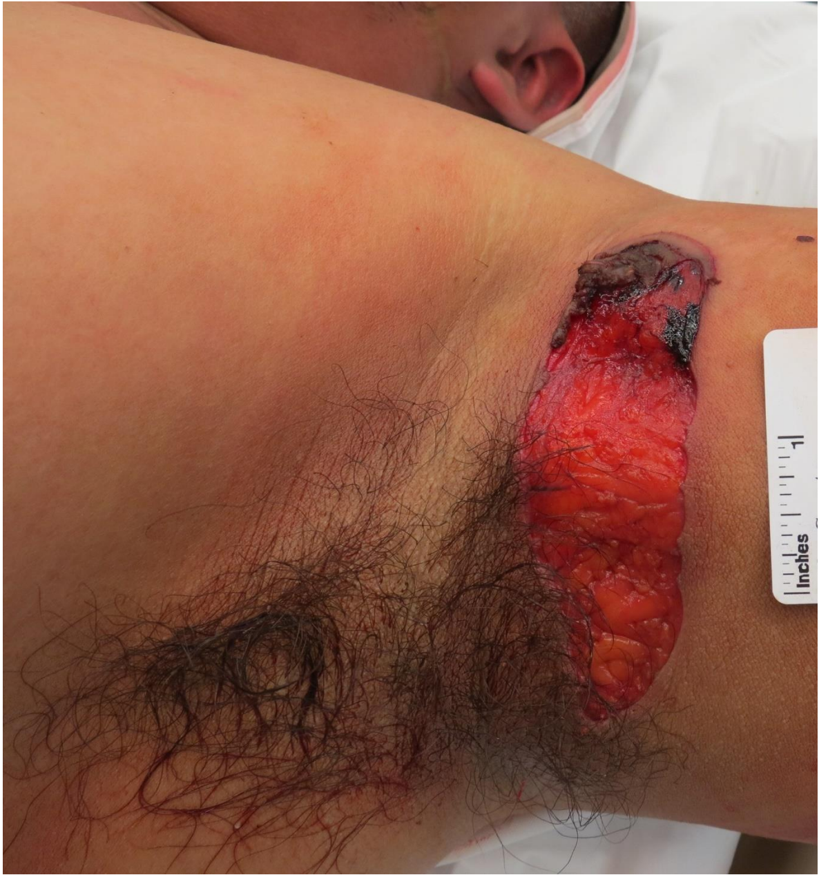
Example of a retractor (rib spreader) injury.