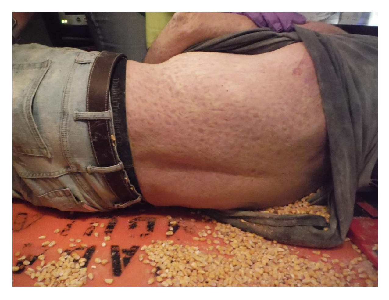
Corn kernel imprints on the decedent's back at the scene