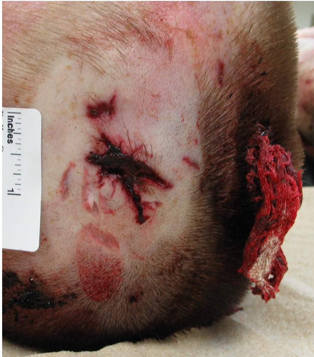
Exit wound and beanbag round