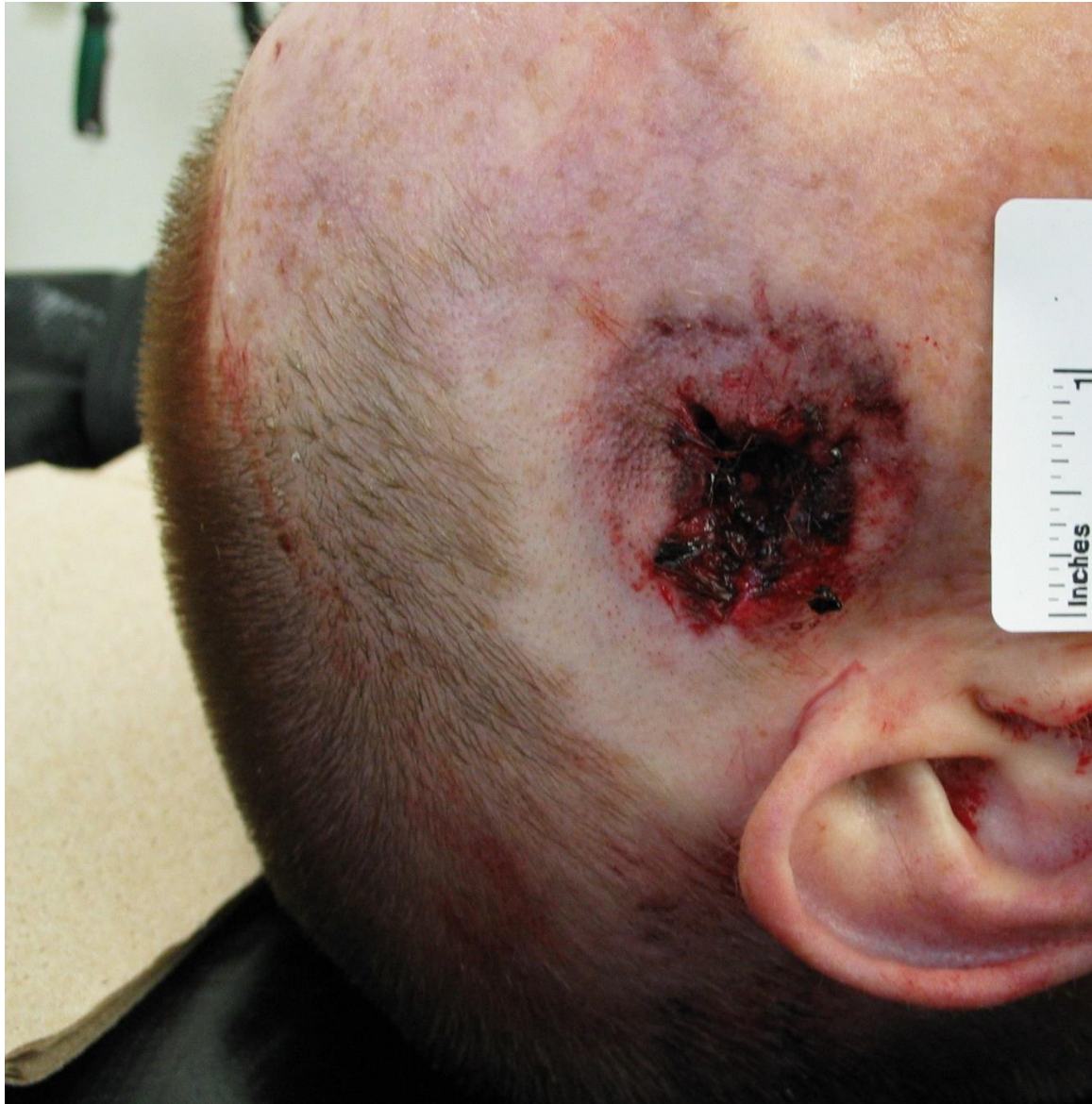
Contact entrance wound