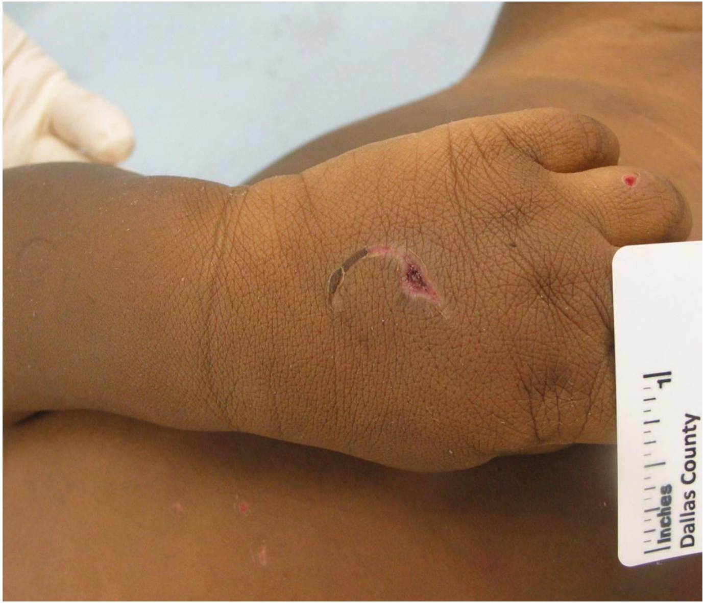
Healing burn from a different case