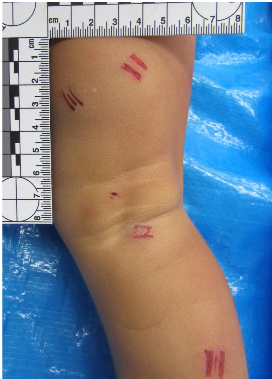
Additional injuries from the same case