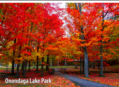
Onondaga Lake Park