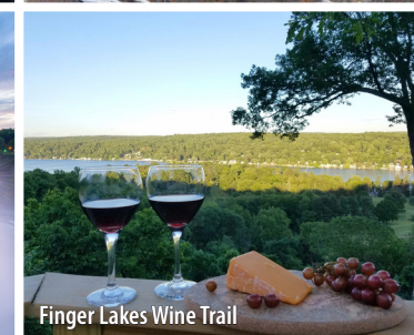
Finger Lakes Wine Trail