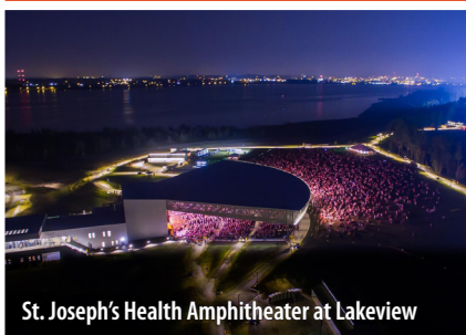
St. Joseph's Health Amphitheater at Lakeview