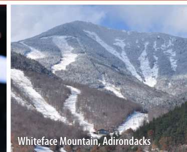
Whiteface Mountain, Adirondacks