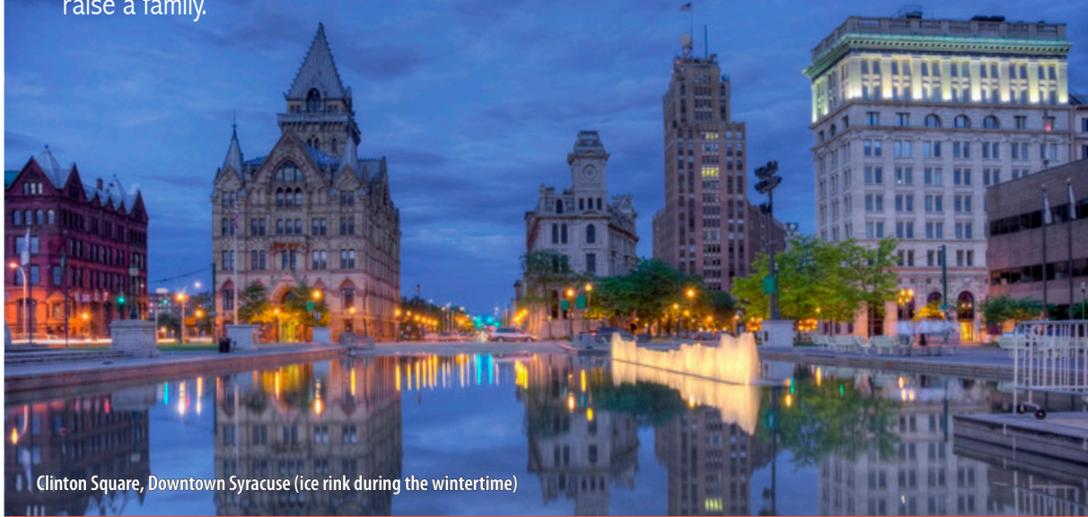
Clinton Square, Downtown Syracuse (ice rink during the wintertime)

From tech, the arts, cultural events, and beautiful natural surroundings to sports and seasonal outdoor activities, Onondaga County is a great place to live, work, play, and raise a family.