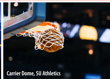
Carrier Dome, SU Athletics