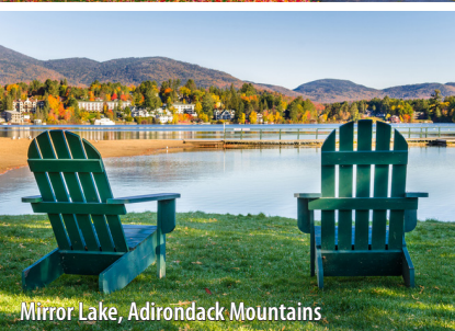
Mirror Lake, Adirondack Mountains