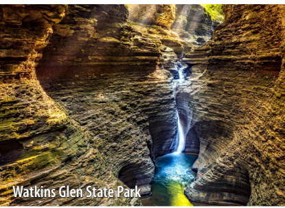
Watkins Glen State Park