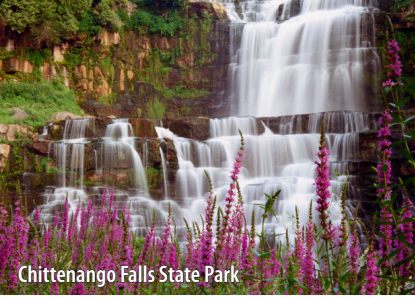
Chittenango Falls State Park