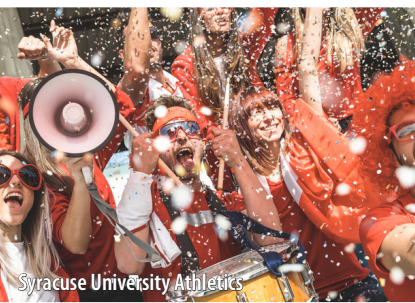
Syracuse University Athletics