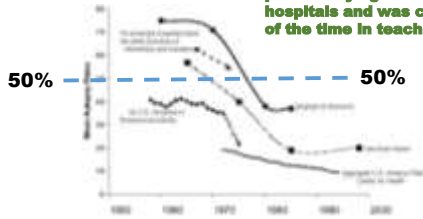
How Common Is Death with No Apparent Cause on an Autopsy?, Quora, 2011, https://www.quora.com/How-common-is-death-with-no-apparent-cause-on-an-autopsy

In 1950, an autopsy was conducted on one-half of the patients dying in American hospitals and was conducted 90% of the time in teaching hospitals.